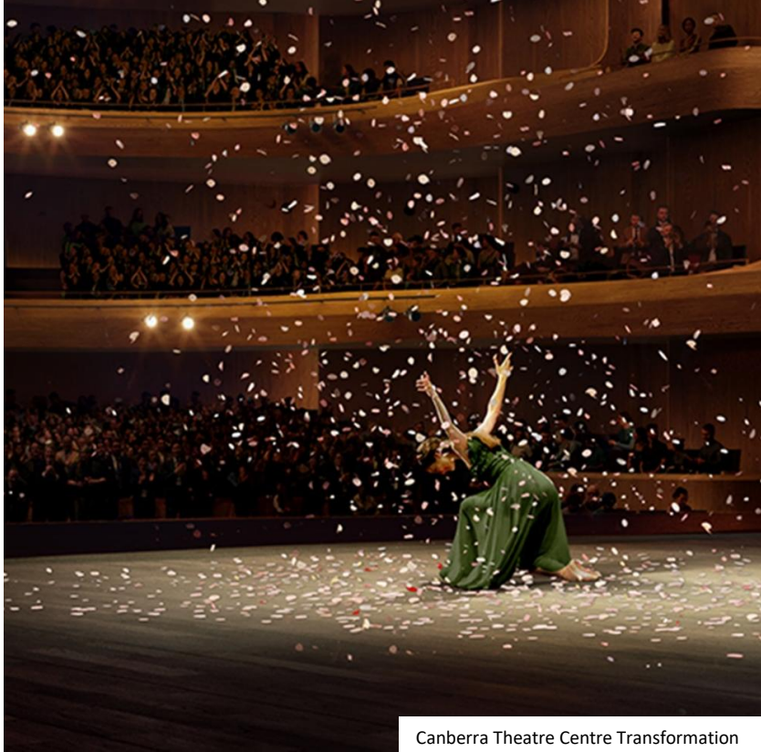
Canberra Theatre Centre Transformation