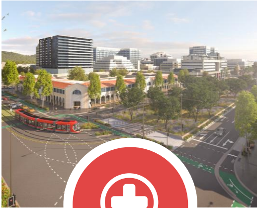
Health, Education and Justice