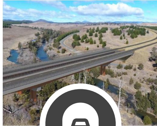
Transport, Civil and Waste